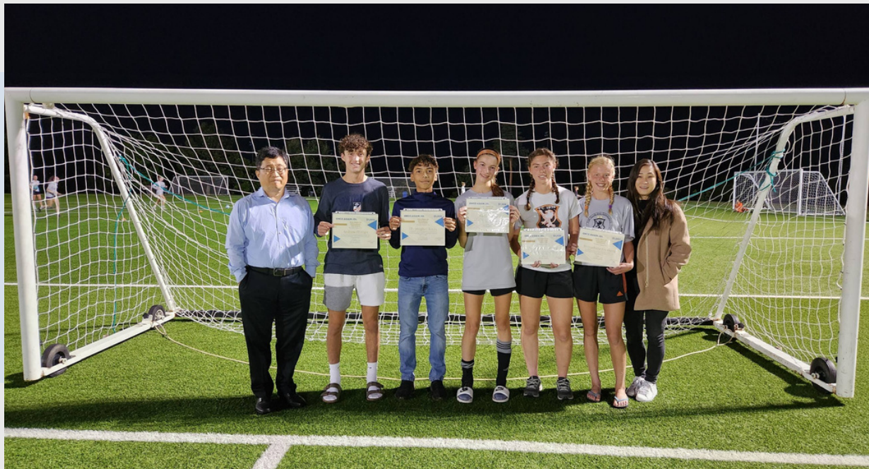
GLSA Dream On Scholarship recipients